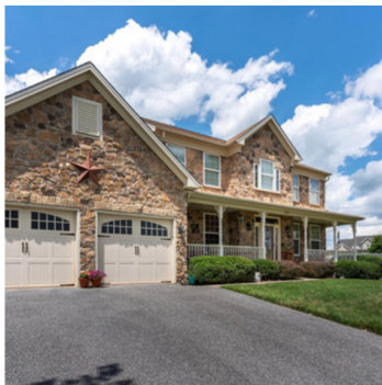
2222 Coleman Court Manchester, Md 21102 5 BD 3 BA 1 HB 4,852 SF $574,900