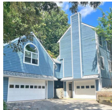
1040 Park Rd Crownsville, Md 21032 4 BD 3 BA 1 HB 3,153 SF $700,000