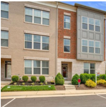
10601 Eastland Cir Upper Marlboro, Md 20772 3 BD 3 BA 1 HB 2,824 SF $569,000