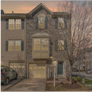
6636 Latrobe Falls #93 Elkridge, Md 20833 3 BD 2 BA 2 HB 2,440 SF $473,000