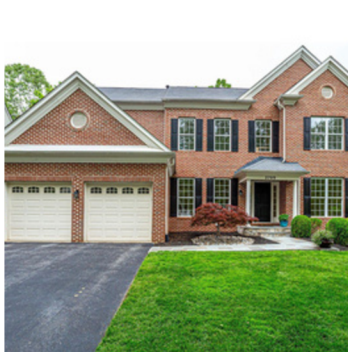
2709 Silver Hammer Way Brookeville, Md 20833 5 BD 3 BA 1 HB 3,128 SF $915,000