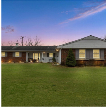
13207 Iris Ct Bowie, Md 20715 3BD 2 BA 1 HB 1,849 SF $499,000