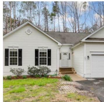
721 Welsh Dr Ruther Glen, Va 22546 3BD 2 BA 1,558 SF $303,000