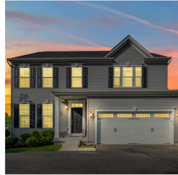
9022 Melody Dr, Laurel, MD 20723 4 BD 3 BA 1 HB 3,470 SF $720,000