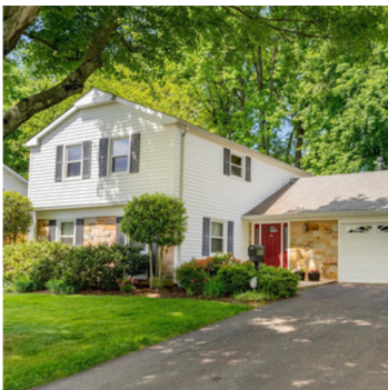
16212 Audubon Lane Bowie, Md 20716 4 BD 2 BA 1 HB 2,400 SF $495,000